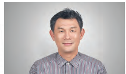
Yen Wen Chen (Spark Chen)

Full profile available at https://investors.dlink.co.in/board-of-directors/